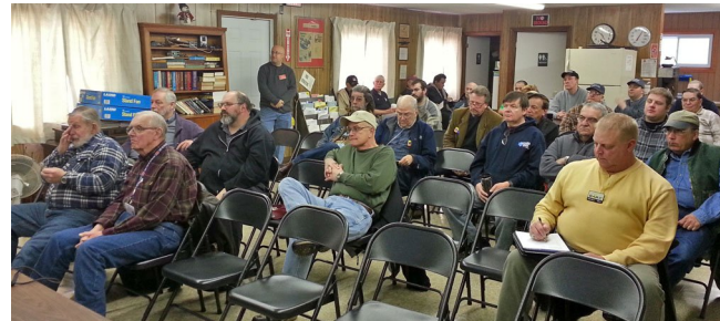
2013 MARCH ARES DISTRICT MEETING ATTENDEES