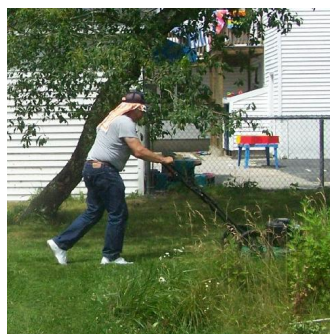
WHO'S THE ARAB? [RAY-KB1EVX WITH SUN PROTECTION]

Most Thursdays, after the Coffee Crowd has exhausted their welcome at the Dunkin Donuts store, some of the folks take a ride over to the clubhouse to see how it looks. If the grass can stand a trim, that's when they go to work grooming the grass.