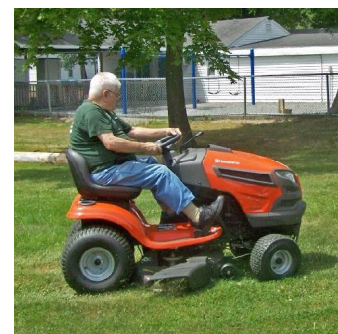
MARTY-KA1YFV DOING THE HONORS ON THE NEW TRACTOR