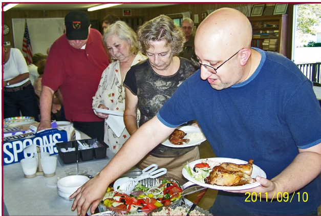
LOADING UP PLATES