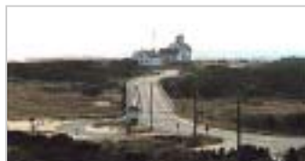
MARCONI SITE 1 MILE DISTANCE

Contacts included Sao Tome (an Island off of Africa), Benin, Kuwait, New Zealand, Australia, Japan, European and Asiatic Russia. A number of contacts were made with other International Marconi Day Stations in Ireland, Great Britain, Canada,