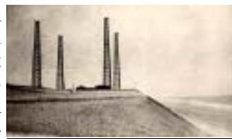
ORIGINAL 4 TOWERS

and the USA. A formal message was received from the Marconi Point Reyes Station, K6KPH - Point Reyes National Seashore, Cape Cod National Seashore's sister station in California.